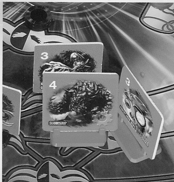
Figure 4: You move your Stonesaur onto a space with an opponent's Saucer Head Shark. Now you must battle!

You roll 4 dice; your opponent rolls 3 dice. You roll one Fire symbol, one Nature symbol and two (wild) dragons. Your opponent rolls two Water symbols and one Darkness symbol. Your red symbol and two dragons beat your opponent's two blue symbols. You win the battle!